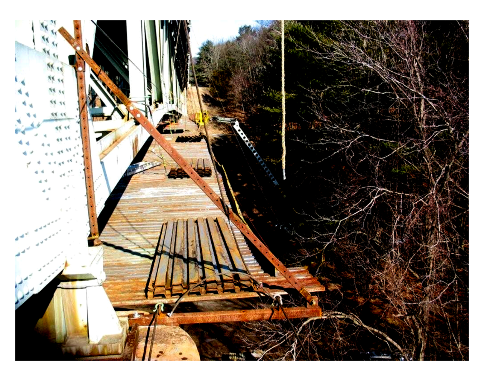
Cable Supported/Metal Deck Platform System