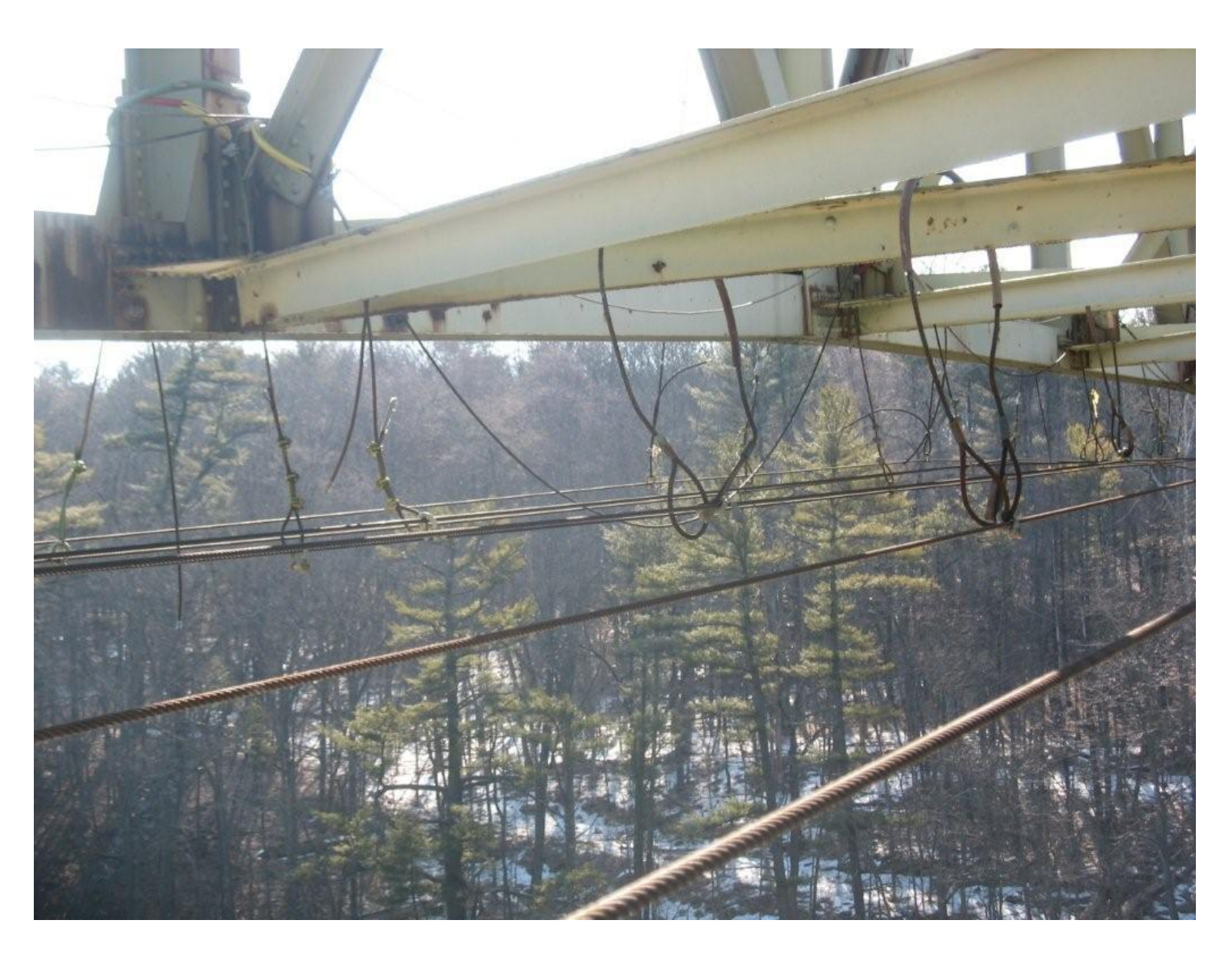
Main Cable System & Tie Up Supports