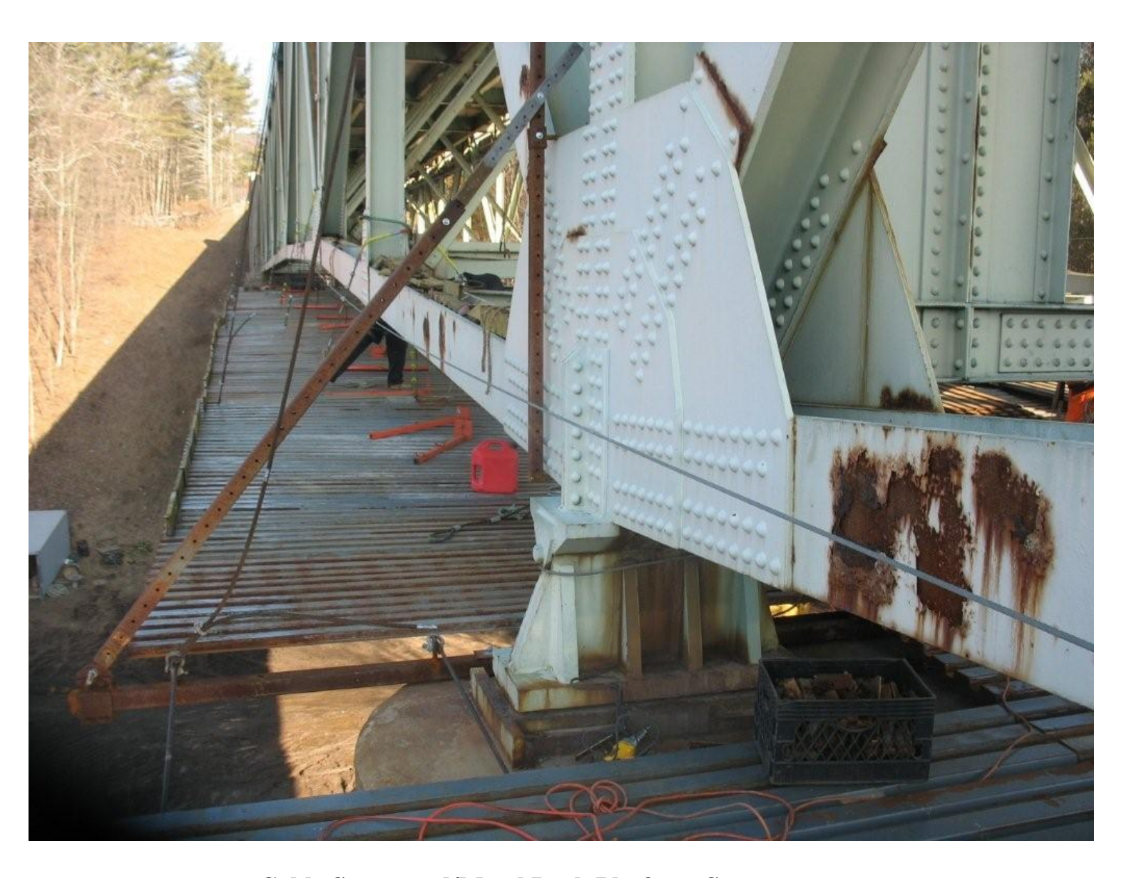
Cable Supported/Metal Deck Platform System