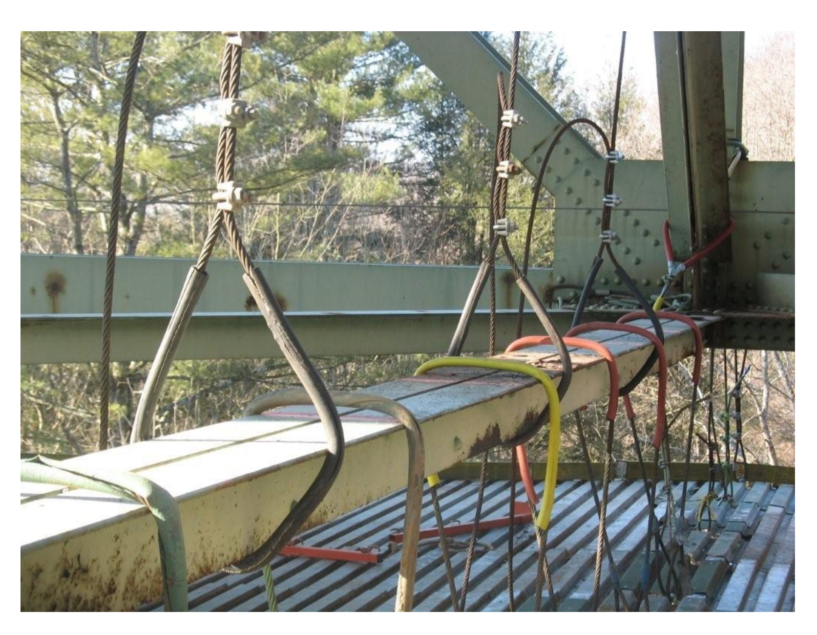
Cable Supported/Metal Deck Platform System