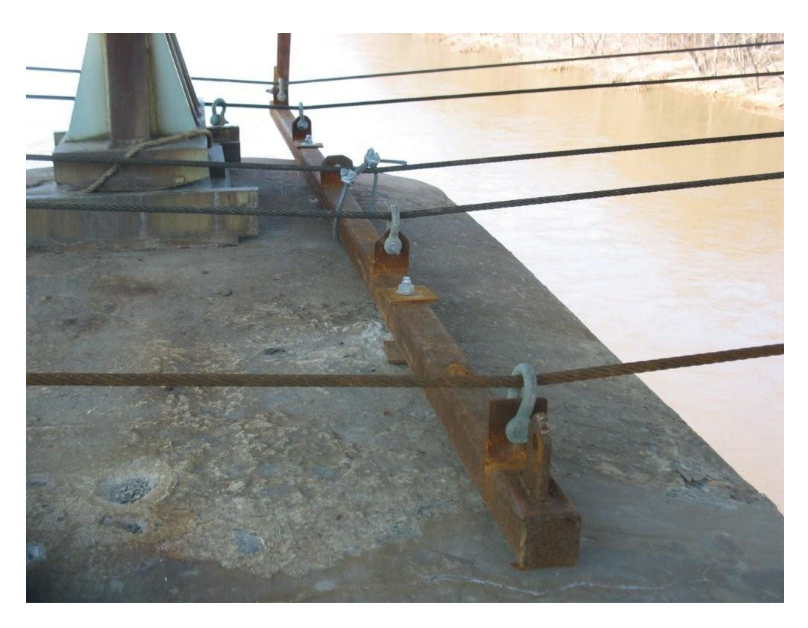
Main Cable System & Cable Hold Down Bracket