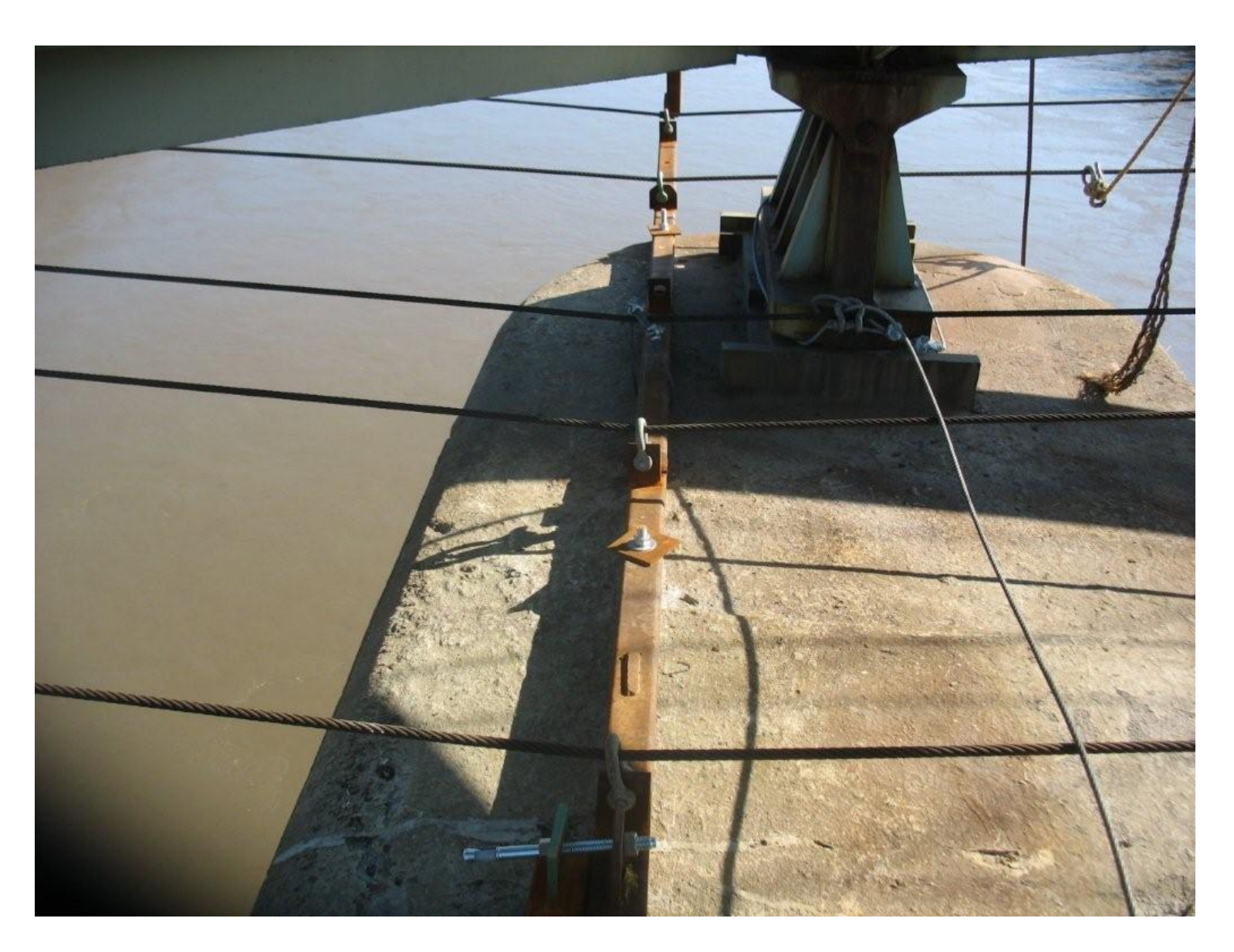
Main Cable System & Cable Hold Down Bracket